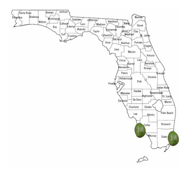
Avocado commercial planting in Florida.

and Indonesia. In the U.S. avocados are produced in California, Florida, Puerto Rico, Hawaii, and Texas.