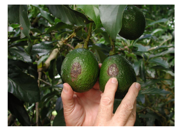
Red-banded Thrips.