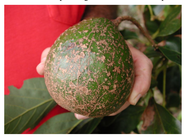
Avocado scab.

as they mature. Lesions appear as small, dark spots visible on both sides of the leaves. Spots on leaf veins, petioles and twigs are slightly raised, and oval to elongated. Severe infections distort and stunt leaves. Spots on fruits are dark, oval and raised and eventually coalesce to form cracked and corky areas which impair the appearance but not the internal quality of the fruit. Begin a spray program for scab prevention when bloom buds begin to swell and continue spraying until harvest. Many avocado varieties are resistant or moderately resistant to scab and no control is necessary. Some varietes such as 'Lula' are very susceptible to scab and are not recommended for planting in the home landscape.