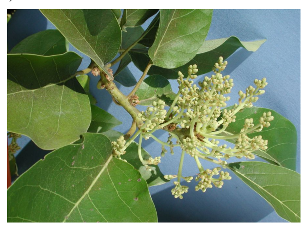
Avocado inflorescense (flowers).

The many-flowered lateral inflorescences (structures that hold the flowers) are borne in a pseudoterminal position. The central axis of the inflorescence terminates in a shoot. Flowers are perfect, yellowish-green, and 3/8 to 1/2 inch (1 to 1.3 cm) in diameter.