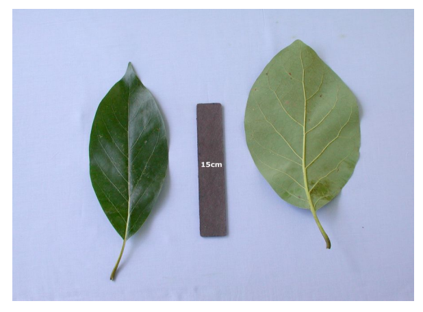
Avocado leaves.

Leaves are 3 to 16 inches (7.6 to 41.0 cm) in length and variable in shape (elliptic, oval, lanceolate). They are often hairy (pubescent) and reddish when young, then become smooth, leathery, and dark green when mature.